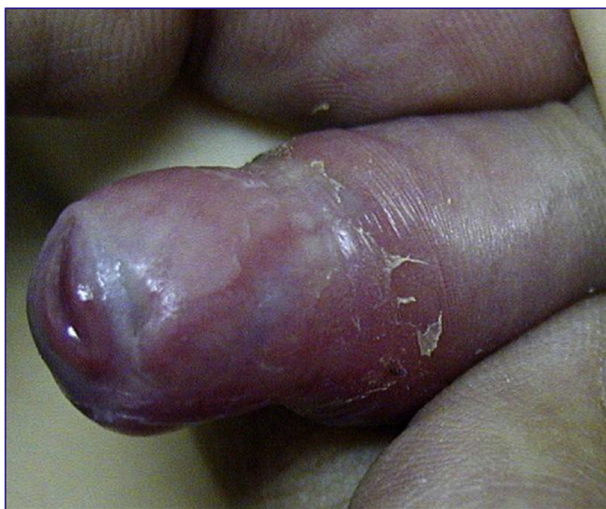
Figure 2 Classically appearance observed in BXO in uncircumcised children; phimosis and a whitish ring with discoloration of the glans.

Classically, signs and symptoms observed in BXO in uncircumcised children are progressive phimosis, typically appearing as a whitish ring with discoloration of the glans,